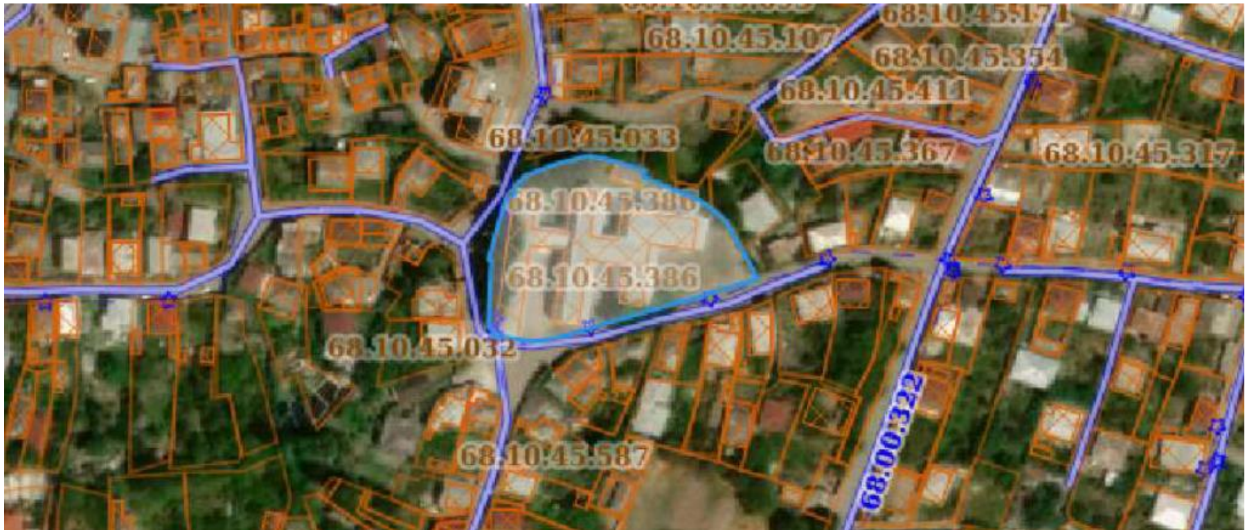
Attachment 1: Ortho Photo